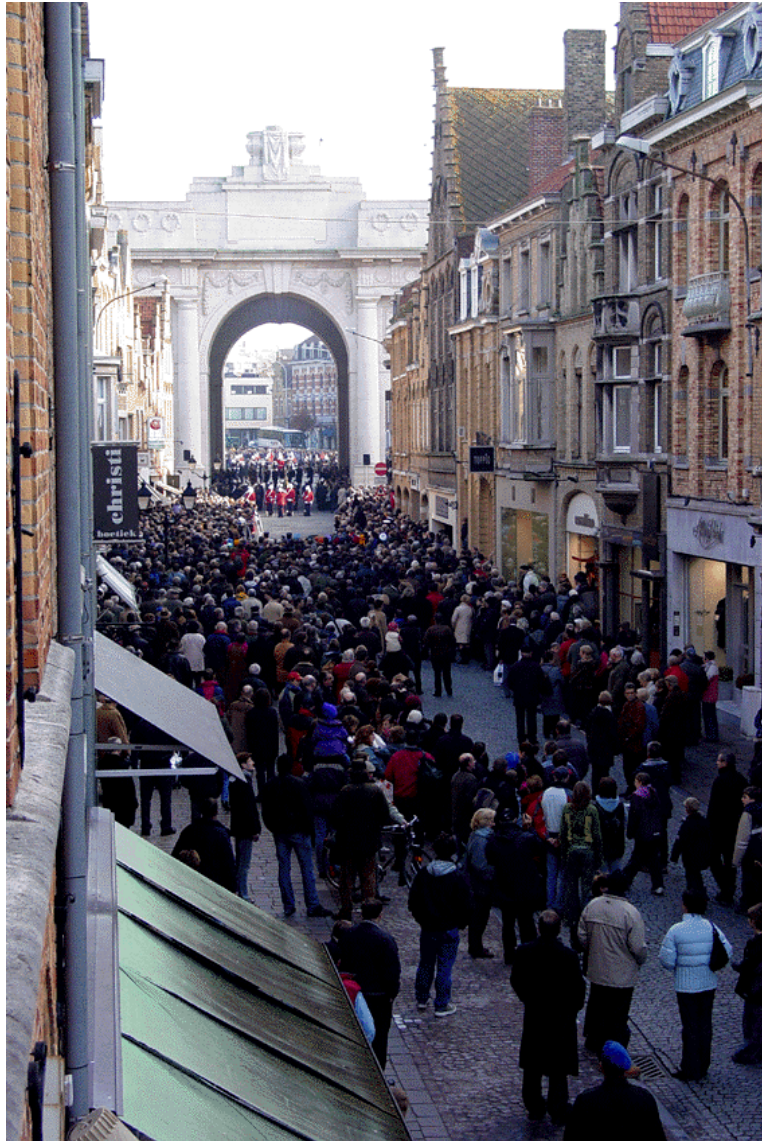
Menin Gate, Ypres, Belgium, 11/11/2004 54,000 names of the missing including 6,924 Canadians are commemorated here.